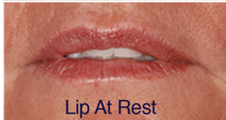
Lip At Rest